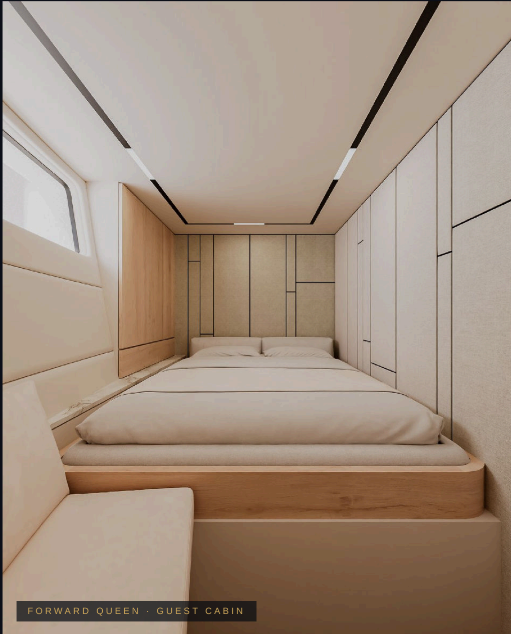
FORWARD QUEEN · GUEST CABIN

Aft of the master, two guest cabins offer private retreats shaped around different voyage needs. A forward queen cabin provides full wardrobe storage and hull window views, while the twin-berth cabin accommodates two guests with LED underlighting and a shared wet head accessible from the corridor.